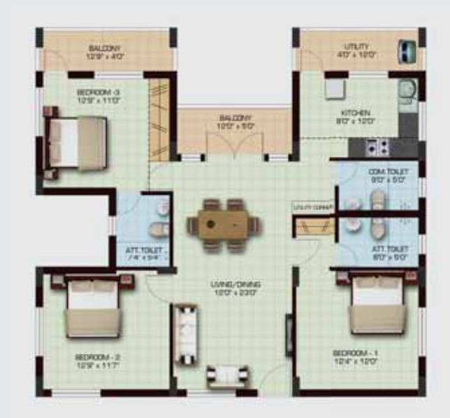
3BHK+3T 1566 Apt.No 101-801