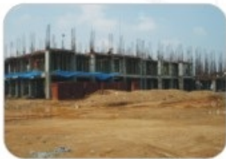
Block - A

We at MARG ProperTies realize the pride and contentment that goes into buying a home.