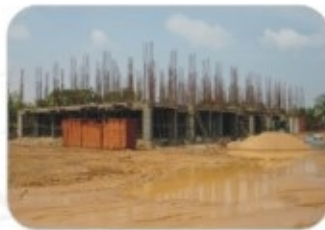
Block - B